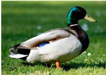
Dutch Canal-living Mallard

The findings prompted a debate among ornithologists over whether ducks in canals were more likely to be fed by passers-by and tourists, thereby gaining excessive weight. In any case, it is unclear if avian diabetes or heart disease will follow.