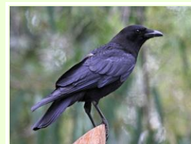
American Crow on Alert

The commonwealth of Massachusetts brought in an ornithological behaviorist, Dr. Fred Lauranz, to determine reasons for the disproportionate percentages for truck-kills versus car-kills. The ornithological behaviorist determined the cause in short order, in findings he announced today, 1 April 2013.